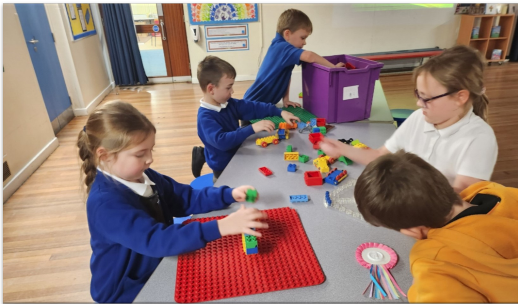
Constructing models with friends after school at the Den

“Therefore encourage one another and build each other up, just as in fact you are doing.” 1 Thessalonians 5:11-15