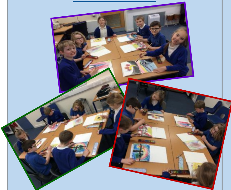
This week, we enjoyed developing our dodgeball skills and painting in art .