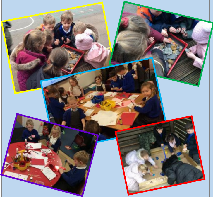
This week, we have enjoyed celebrating International Women in Science Day and learning about Mary Anning