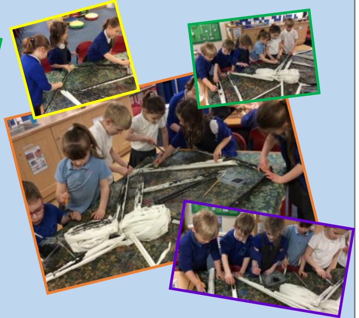
This week, we finished our spider by applying paint using dabbing and brushstrokes .